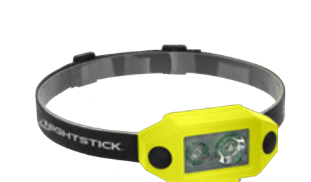
200L 3AAA Dual-Light, Low-Profile XPP-5460GX